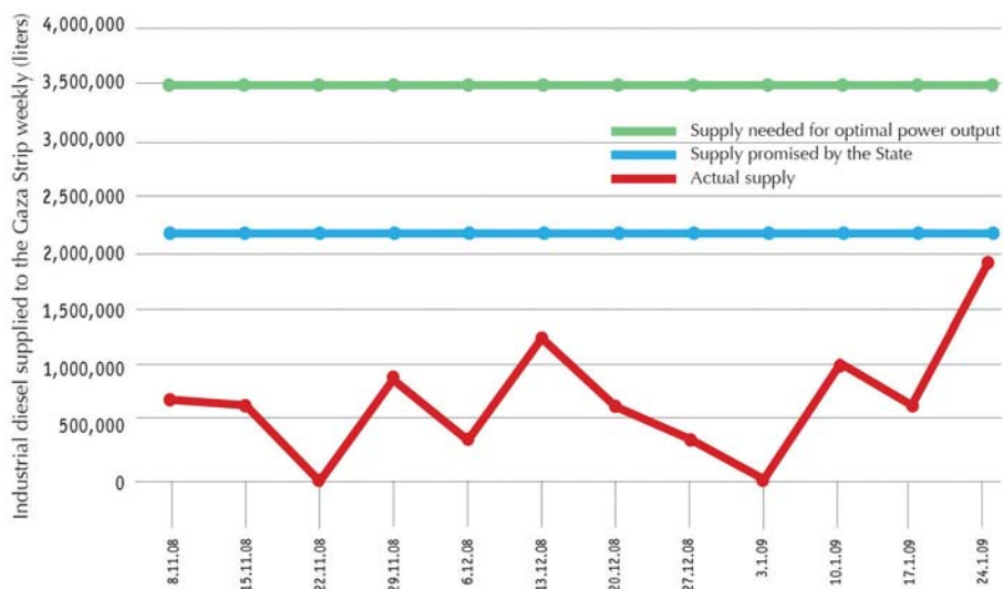
Graph 2 – The Transfer of Industrial Diesel from Israel to the Gaza Strip. November 2008 – January 2009

Gaza’s power station closed down for ten days, beginning December 30, 2008, due to the lack of supply of industrial diesel from Israel. The station’s emergency holding tanks were of no use during this crisis period, since they had already been emptied due to restrictions imposed on the import of diesel prior to the offensive. 28